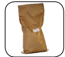
11.4 Kg Replacement charcoal