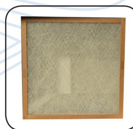
Protection Filter 20"x20" SKU:FVT2020