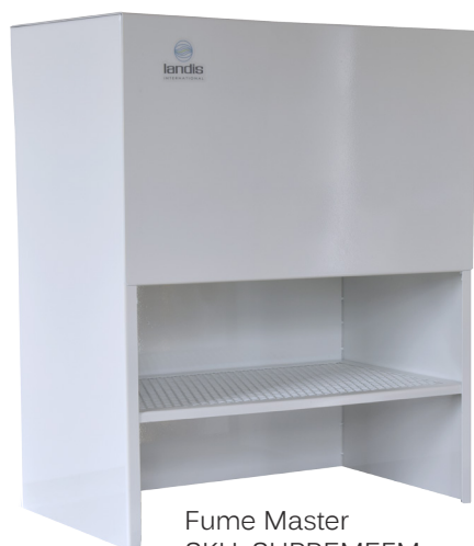
Fume Master SKU: SUPREMEFM

Create a Healthier Environment for Yourself and Everyone Around You