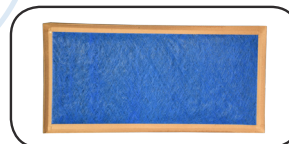
Protection Filter 12"x24" SKU:FVT1224