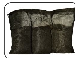
Charcoal Filter for Fume Master SKU:FCAFB