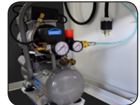
Air compressor included