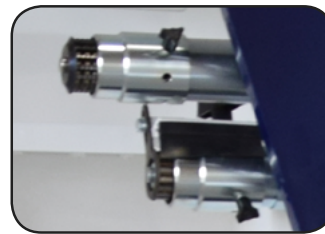
Adjustable sole trimmer SKU: MACKSA