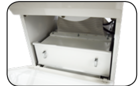
Dust collection drawer