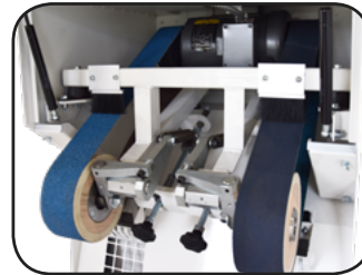
Front access Sanding Belt tracking adjustment